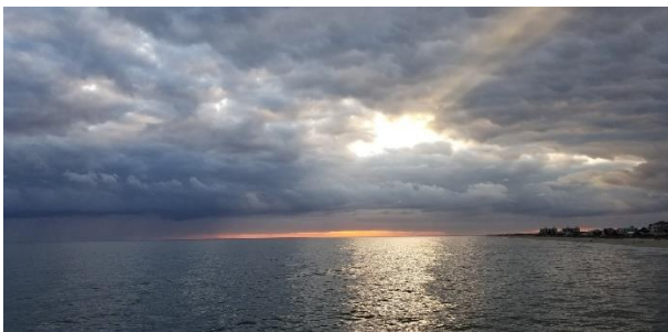
Anne's "Light in the Storm" and "Swamp Elders"