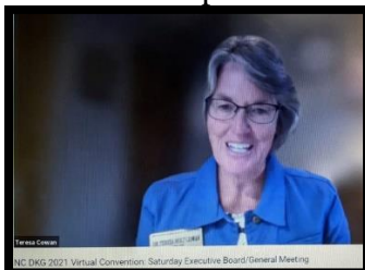
NC DKG 2021 Virtual Convention: Saturday Executive Board/General Meeting

Saturday morning Executive Board Meeting: Actions established the Beginning Teacher Award, approved the NC DKG and Headquarters budgets and new job descriptions for all related personnel positions, heard the slate for 2021-2023 state officers and reports from the ad hoc committees on One Member, One Vote and Regional Directors, recommended the approval of all proposals to the NC DKG Bylaws and Standing Rules , and approved the merger of Beta Phi Chapter with Theta Chapter.