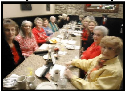
A lovely get-together