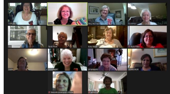
The Chi Board met August 28.